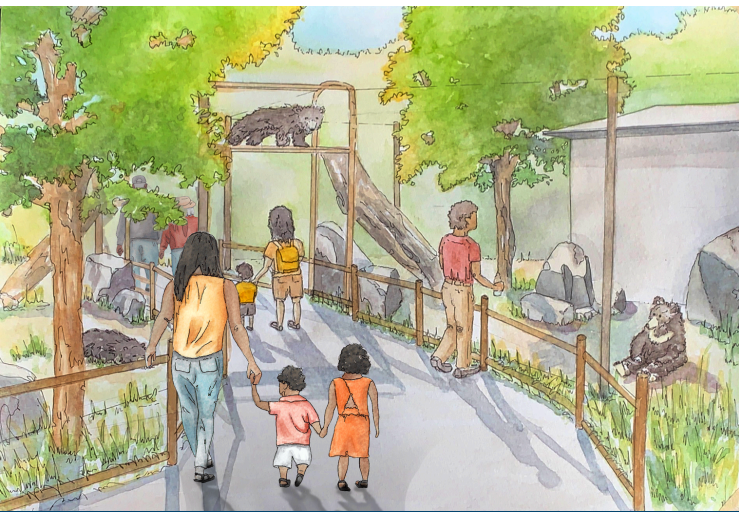
UPDATES TO SLOTH BEAR HABITAT