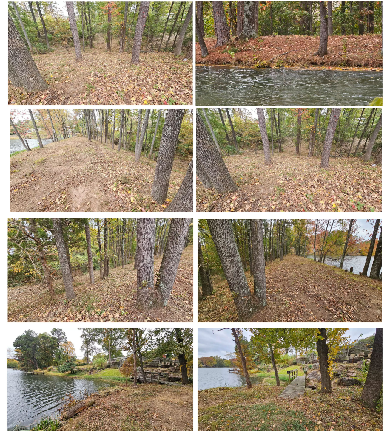
2023 Twin Lakes A lake after

Organized 4 major cleanups, clearing trash, debris & overgrown brush & limbs