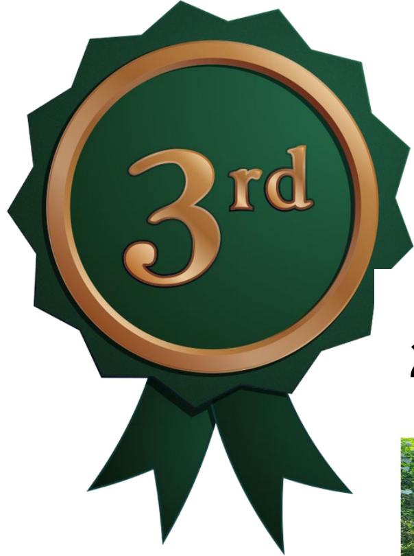
2023 Twin Lakes A lake before