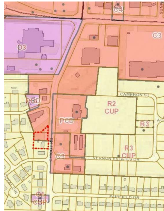
Figure 1. Zoning

Notices were sent to the following neighborhood association: Chicot Neighborhood Association, West Baseline Neighborhood Association, and Southwest United for Progress. At the time of writing, Staff had received no comments from area residents or Neighborhood Associations